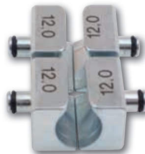
for round belts